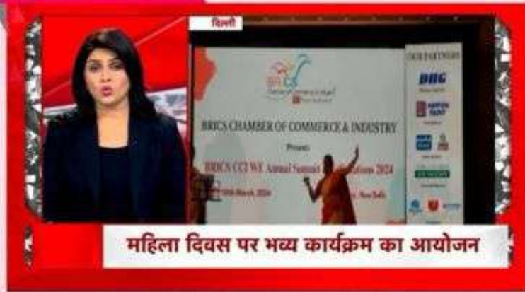
महिला दिवस पर भव्य कार्यक्रम का आयोजन