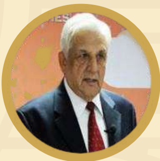
LT GEN D.V. KALRA (RETD)